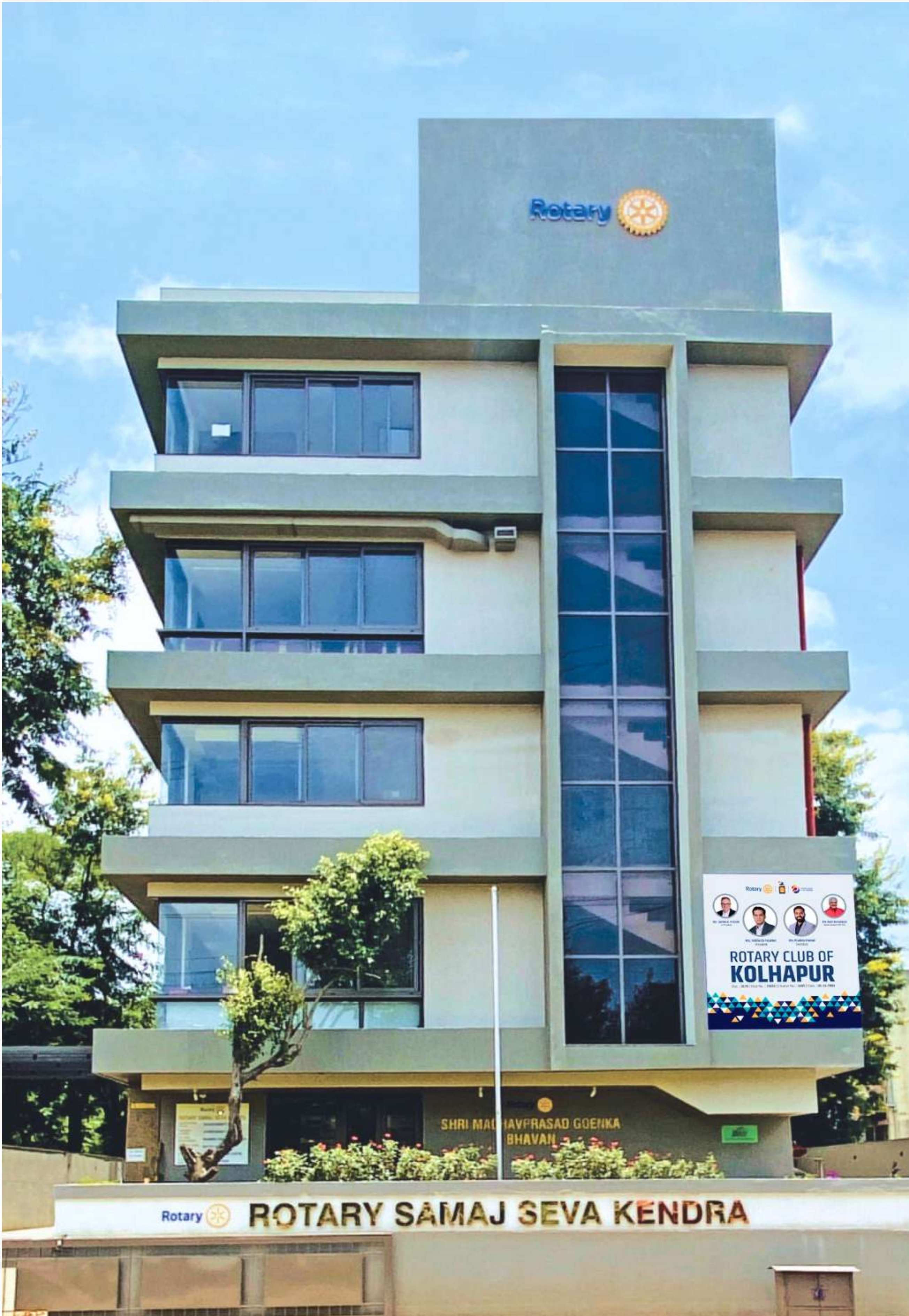
ROTARY CLUB OF KOLHAPUR'S ROTARY SAMAJ SEVA KENDRA BUILDING